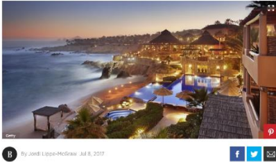
By Josh Lopez-McGraw Jul 8, 2017

You'll want to book these epic escapes stat.