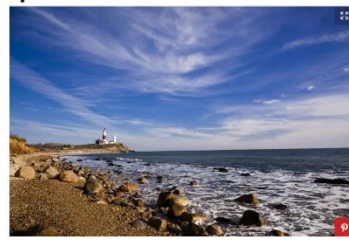
Best for: Beach bums

Montauk may have gained a reputation as a bit of a party beach town in recent years, but the area's newest hotel is all about taking it easy and enjoying the OG beach lifestyle. " Sole East Beach is perfect for a group of women who are all about hanging at the beach — it's the one hotel located across the street from the ocean," says Stein. But party spot The Sloppy Tuna is just a three-minute walk away in case you want to cut loose.