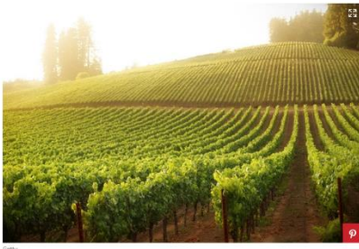
Best for: Winos