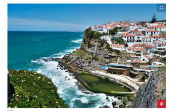
Best for: Urban explorers

Lisbon is becoming one of Europe's major urban hotspots — and for good reason. "Lisbon had deep-rooted history mixed with a very vibrant local scene," says Stein. "It's not as glamorous as some of other European cities, but that's the authentic charm I love. Not to mention, that makes for some pretty affordable pricing." Spend a few days wandering the cobblestoned streets, taking in some beautiful views of colorful pastel-colored buildings, peeping on seafood and vino verde wars, and then doing it all over again. Make Hotel Valverde , with its colorful design and central location (the Botanical Gardens are practically across the street), home base for your exploring.