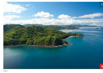
Best for: Adventure junkies