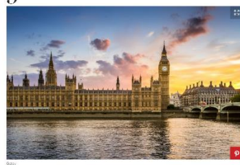
Best for: Foodie fashionistas

London, with its hundreds of eateries, shops, and museums, is ideal for those who prefer exploration to relaxation — and the best part is you can easily cover a lot of ground in a long weekend. Book a room at the new The Ned hotel in the heart of London proper, where even locals love hanging at one of the nine bars and restaurants (one is in a former bank vault) or at one of the two pools. "Although there's no need to ever leave the building, the city is at your doorstep, making it quite easy to do it all," says Stein.