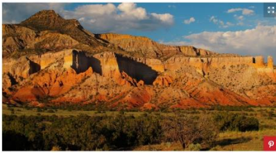
Best for: Spa lovers