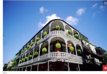
Best for: Party starters

Sick of showing up to work every day with your shit together when all you want to do is party? "Everyone knows that New Orleans is the place to hear some good music and eat and drink," says Stein. If that's what you're looking for, "stay at The Ace Hotel . With its own concert venue, restaurants, and super popular rooftop bar and pool, it's the coolest game in town and perfect for a group of friends looking to have a good time in the Big Easy."