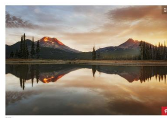
Best for: Activity enthusiasts

Do you like insanely beautiful landscapes? Do you love being outside and staying active? Do you also like having delicious food and plenty of spas to come home to at the end of a long day? This is exactly where you want to be. "Bend is a hidden gem in the Pacific Northwest that's perfect for outdoorsy types," says Stein. Stay at the new Springhill Suites , which is within walking (or running) distance of the downtown Old Mill District, an area full of great shops and restaurants, and a quick ride (by bike or by car) to the trails.