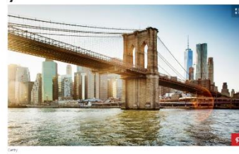
Best for: Local culture seekers

Over the last few years, Brooklyn has been making its mark as the capital of cool. With its dive bars, artisan clothing shops, and quaint bistros, you won't even want to cross the bridge to the more traditional Manhattan. You'll get a good view of the island, however, from 1 Hotel Brooklyn Bridge , a new hotel in DUMBO overlooking the East River. "It's a hotspot for locals because of its incredible rooftop and onsite restaurants — and some of the rooms even have hammocks," says Stein.